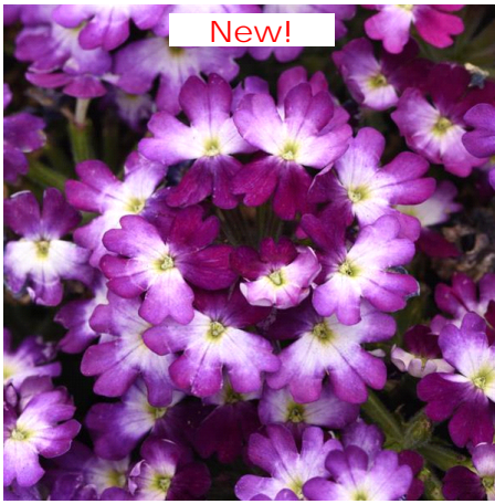
Beats™ Blue+White Verbena