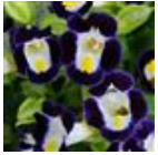
Blue & White