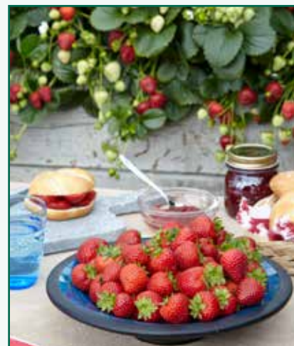
Delicious home -grown strawberries