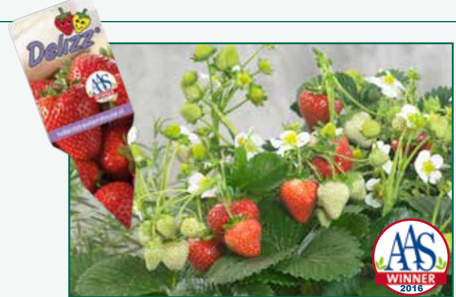
Plant labels available on request