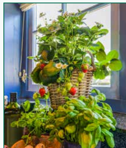
Strawberry plant Delizz®

For more information please contact us at: