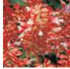
Red And White