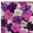
Spark Mixture Improved