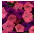
Opposites Attract Mixture