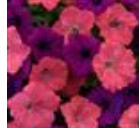
Opposites Attract Mixture