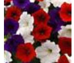
The Flag Mixture