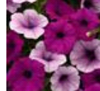
Plum Pudding Mixture