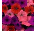
South Beach Mixture