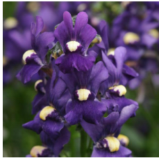
Aromatica™ Royal Blue