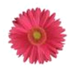
Rose with Light Eye