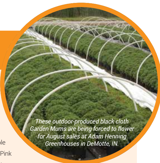
These outdoor-produced black cloth Garden Mums are being forced to flower for August sales at Adam Henning Greenhouses in DeMotte, IN.

White: Butter N' Cream White, Paradiso White, Starburst White