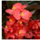
Red Bronze Leaf