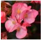
Pink Bronze Leaf Improved