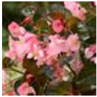
Pink Bronze Leaf