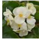
White Green Leaf