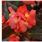
Red Bronze Leaf Improved