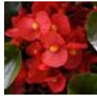
Red Green Leaf