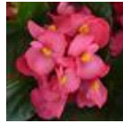
Rose Green Leaf