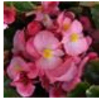
Pink Green Leaf