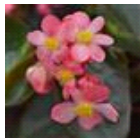
Pink Bronze Leaf