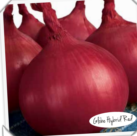
Globe Hybrid Red