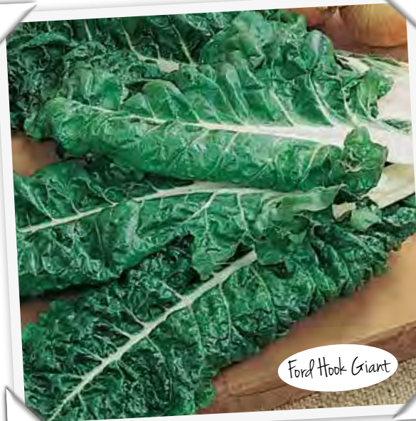
Ford Hook Giant