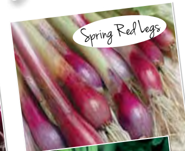
Spring Red Legs